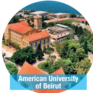
American University of Beirut