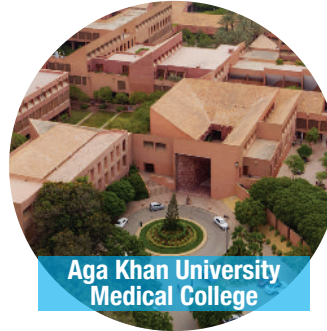
Aga Khan University Medical College

Aga Khan University - Institute for Educational Development