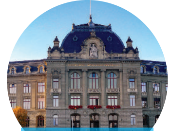
University of Bern