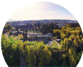
University of British Columbia

Algoma University Brock University Carleton University McGill University Ontario Tech University Queen's University Ryerson University Trafalgar Castle School Trent University