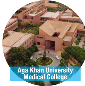
Aga Khan University Medical College

Aga Khan University - Institute for Educational Development