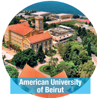
American University of Beirut