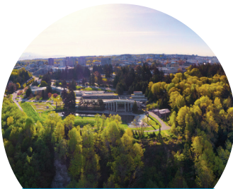
University of British Columbia

Carleton University McGill University Queen's University Ryerson University Trafalgar Castle School Trent University University of Alberta