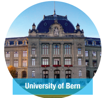
University of Bern